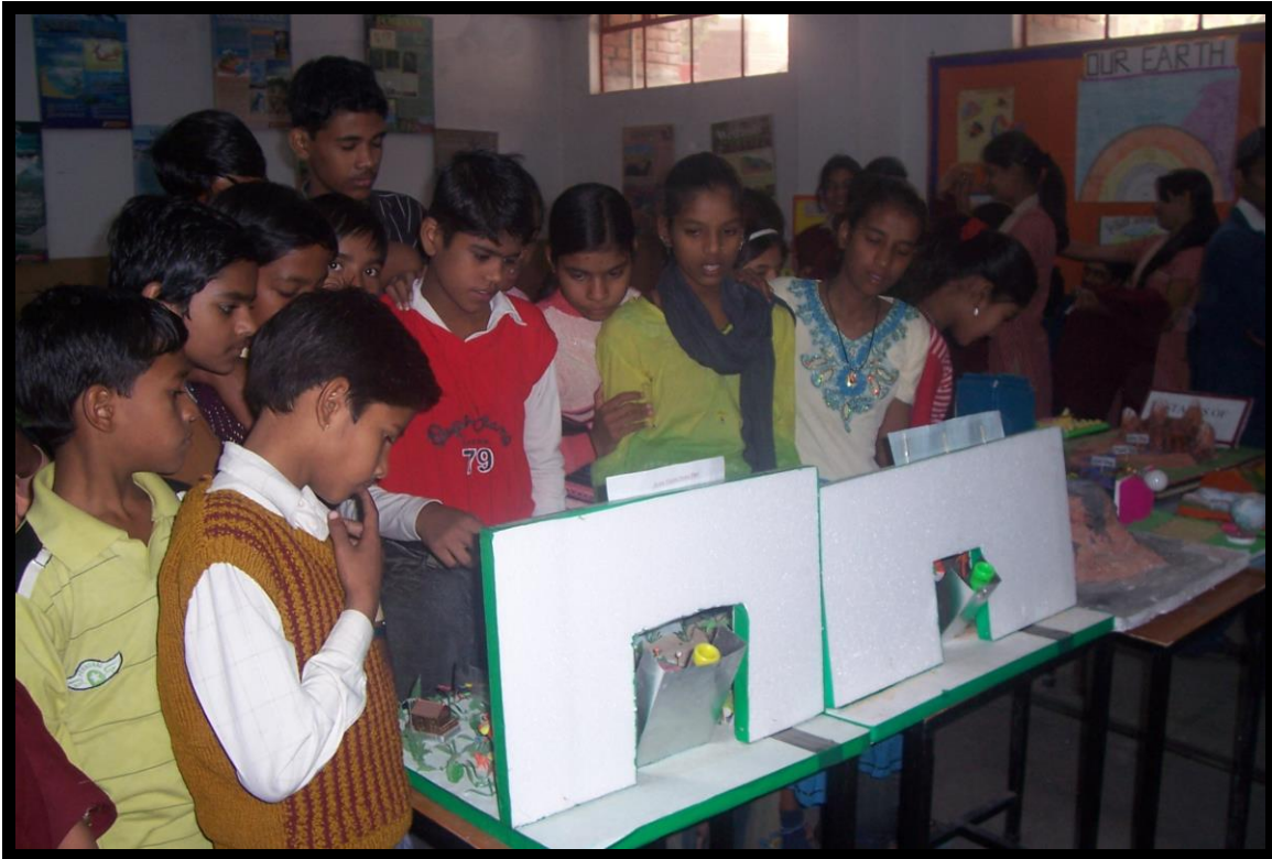
Some students of Saksham attending an exhibition in one of the Public schools in the neighbourhood.