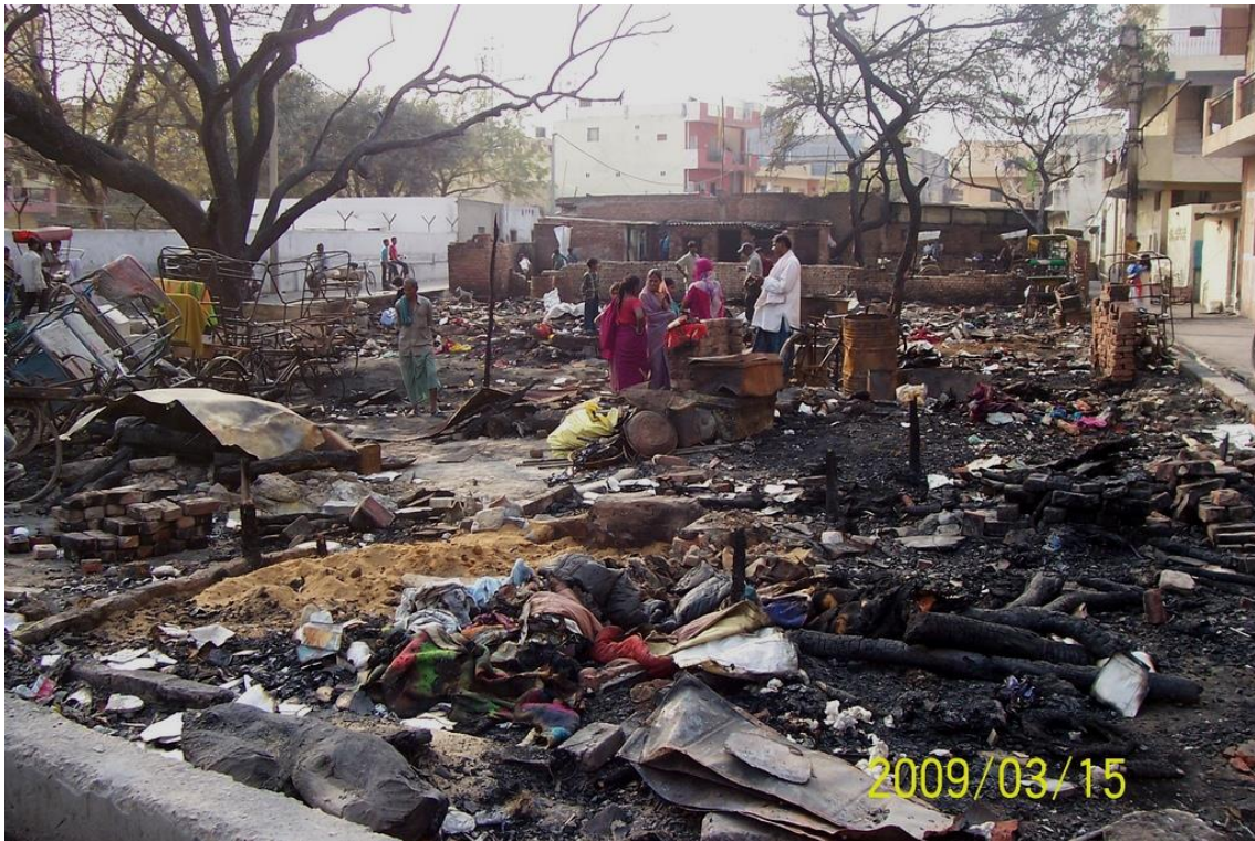
A few months ago, a small "jhuggi" cluster within Nithari Village was razed by fire.